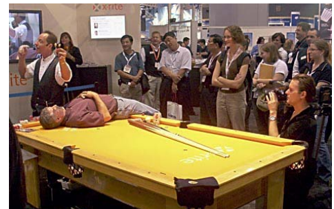
A lively presentation by X-Rite, one of the many exhibitors at Print '05

Students took advantage of this unique opportunity made possible with the funds available from the Junior/Senior Enhancement Experience. They also showed a commitment to their future by giving up their weekend to travel to Chicago.