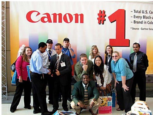
Graphic Communications students at Print '05

As part of the CBBS Junior/Senior Experience, the Department of Graphic Communications helped thirty-one students attend a printing industry trade show. Print '05 is "the largest, most comprehensive event for the commercial, package printing and converting industry in the world in 2005." It is the largest trade show of any kind held at McCormick Place in Chicago, Illinois. This show had over 80,000 people attend covered more than 750,000 square feet. One of the companies exhibiting at Print '05 had a booth that was as large as a Home Depot store. Typically, the event runs Sunday through Wednesday; however, every four years, it runs for a week over the weekend, which allows traveling to Chicago to spend Saturday Sunday meeting industry reps; there were over 1,000 exhibitors for the students to visit. Some students used the experience to research topics relevant to class projects; to some, it was an opportunity to look at all of the variety of companies they can consider for their future careers. The students were able to pick up samples, watch demonstrations, look inside the machines, and talk to some of the most knowledgeable people in the industry with respect to the equipment, processes,